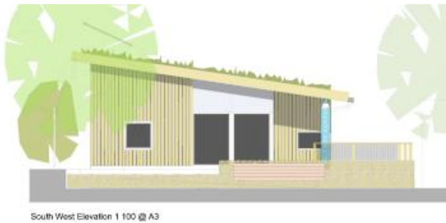
South West Elevation 1 100 @ A3

We have raised a magnificent £300k so far: - £260k from community grants - £38k from fundraising events - £7k from local businesses - £6k from community donations